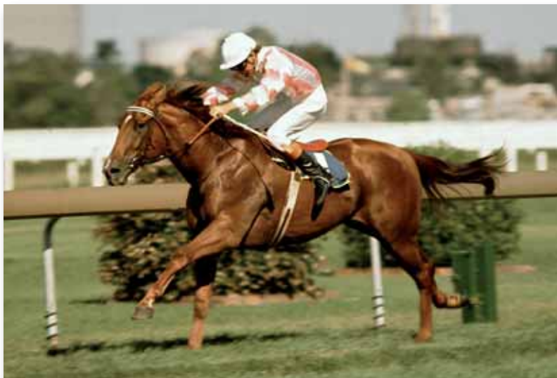
Timeform rates Manikato (136) as Australia's best ever sprinter ahead of Vain (134).

Champion three-year-old Vain is next on 134 with Might And Power on 133.