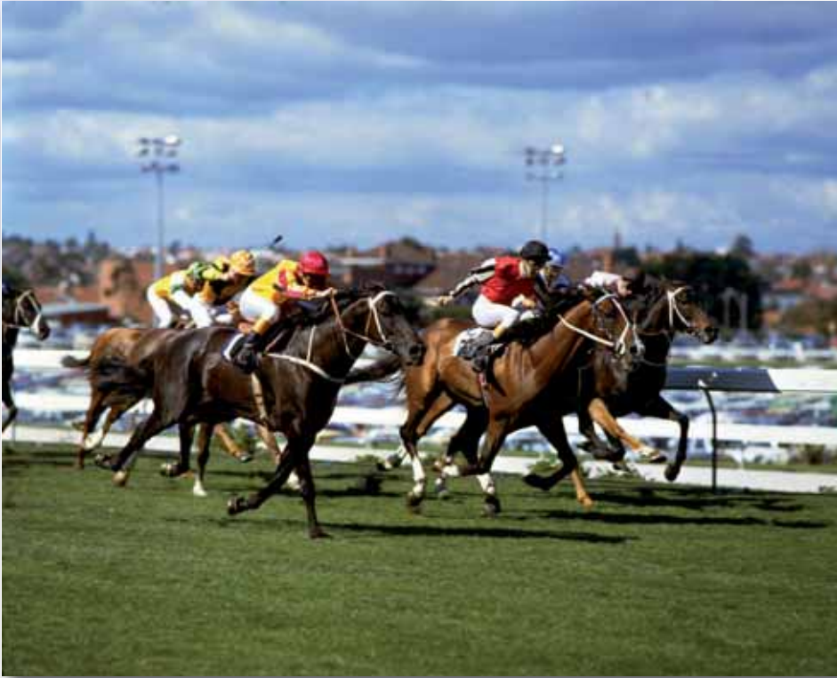
Timeform has credited Kingston Town with a rating of 137, which currently places him as the second-highest rated Australian galloper behind Tulloch (138).

During the last ten years, Racing and Sports has been Timeform's handicapping partner for the provision of Timeform ratings for Australia, New Zealand and parts of Asia.