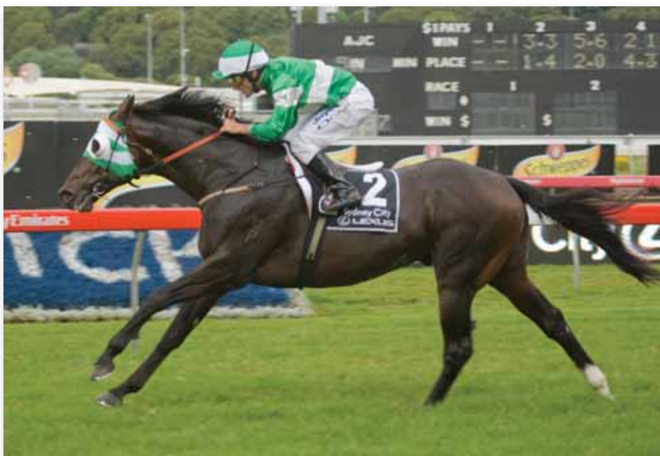
Road To Rock

What other horses are currently in work that you have bred?