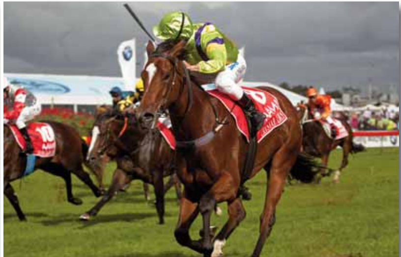
Crystal Lily's Golden Slipper win topped off a remarkably consistent preparation and she sits at the top of the Australian 2YO Rankings with a 122 rating.

The three-year-old sprinting form has held up not only in Melbourne through Wanted, Starspangledbanner and Shellscape but also at the Sydney Autumn Carnival through three-