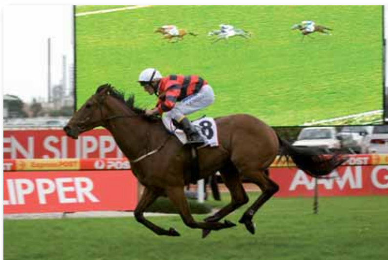
Weekend Hussler's rating of 130 places him as the highest rated local galloper of the past 10 years, slightly ahead of Makybe Diva, Northerly & Sunline (all allocated a 129 rating).