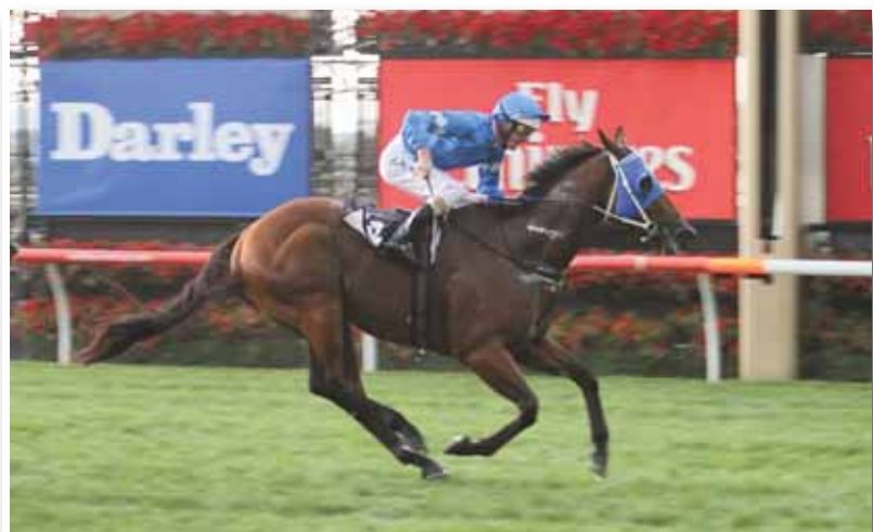
Wanted shares the highest 3YO rating (126) with Starspangledbanner. Both colts were able to topple the older sprinters when winning the Newmarket Handicap and Oakleigh Plate respectively.

year-old filly Melito (119) winning the Group One T J Smith Stakes and of course Shellscape (122) just going down in the Group One Galaxy to the smart mare Ortensia.