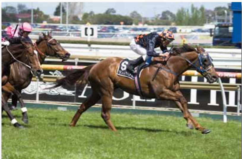
Whobegotyou is the top-rated 4YO and his rating of 127 also ranks him as the equal top-rated racehorse in Australia at present.

It seems as if we will not see Rangirangdoo again until the Spring where he will target the Group One W S Cox Plate, but the 126 rating should ensure he finishes close to the top of the 2009/2010 Timeform Handicaps.