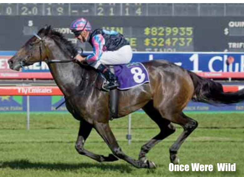
Once Were Wild