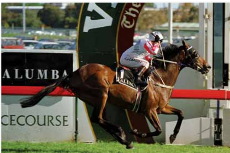
Might And Power (133) is the highest rated Australian racehorse of the past 20 years.